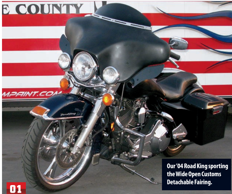
Our '04 Road King sporting the Wide Open Customs Detachable Fairing.